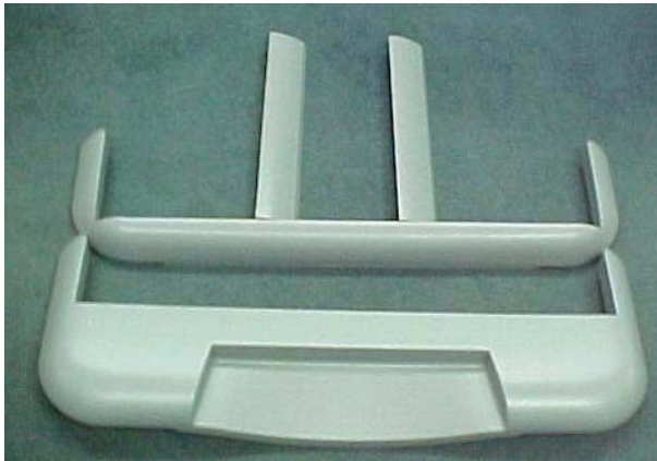
Figure 1-1. Bumper Kit