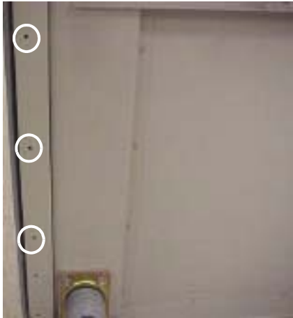
Figure 1-4. Side bumpers