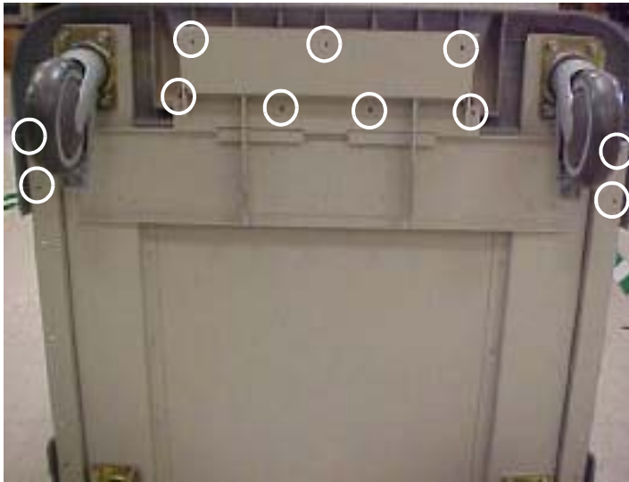
Figure 1-2. Front bumper