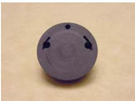
Pump head, bottom view. Note the pump head alignment hole is shown at the top in the photo.