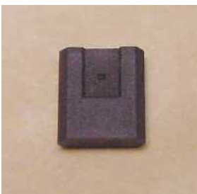
Vane. The void in the vane (shown at the top in the photo) is placed next to the slot side of the rotor nearest the pump motor shaft and closest to the pump head when properly installed.