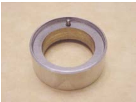
Cylinder. Note the pump head alignment pin is shown at the top in the photo.