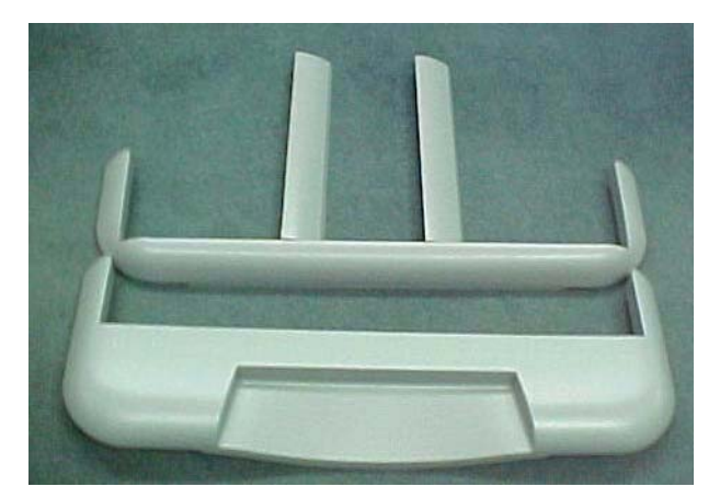
Figure 1-1. Bumper Kit