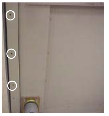
Figure 1-4. Side bumpers

7. Secure the left and the right bumper respectively, by engaging the fasteners with the retainers in the bumpers.